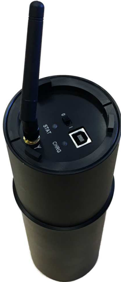
v.1 – 2017